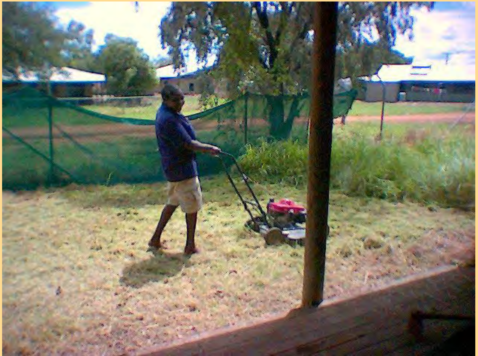
Cultural Mapping © 2010