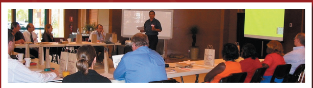
Partnership Forum Narana